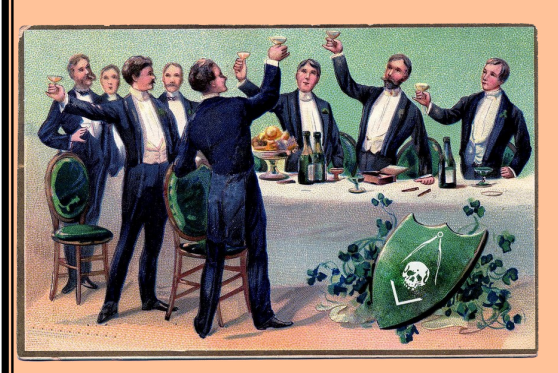
TABLE LODGE—June 15th

Brethren, our Table Lodge at Widow's Sons' will be held on June 15th and will be combined with our monthly Stated Communication.